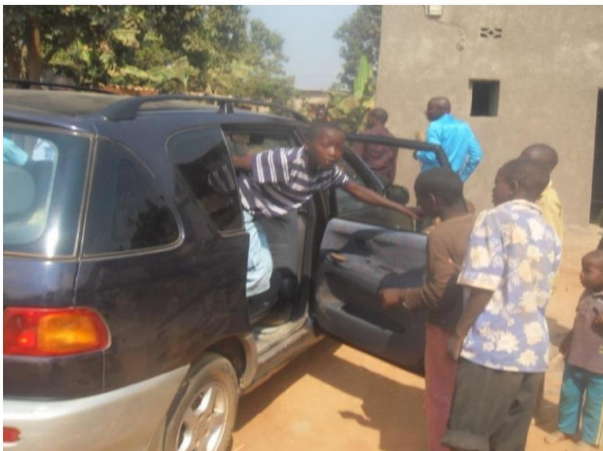
Here is in Rweru sector where HGL arrived with children in their families