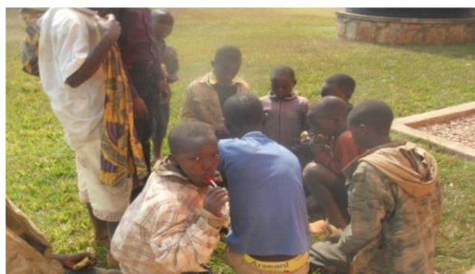
Figure 1: Lifestyle of street children

List of street children who received counseling by Hope for a Good life in 3 month