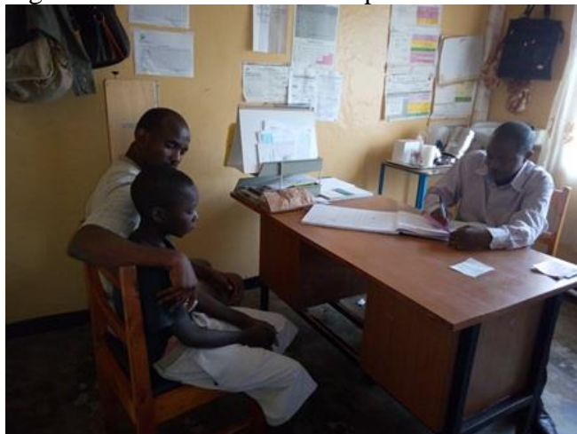
Figure 1: Street children in Hospital

Due to the bad condition of street children living on the streets, many children are attacked by different illnesses like malaria, diarrhea ... Hope For a Good Life help them go to the hospital