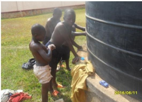
Figure 4: Preparations of street children who were ready to return into their families

Due to counseling the street children received they handed over voluntarily the drugs they were consuming and took decision to never consume that again. Street children are handing over the drugs to volunteers of Hope For a Good Life.