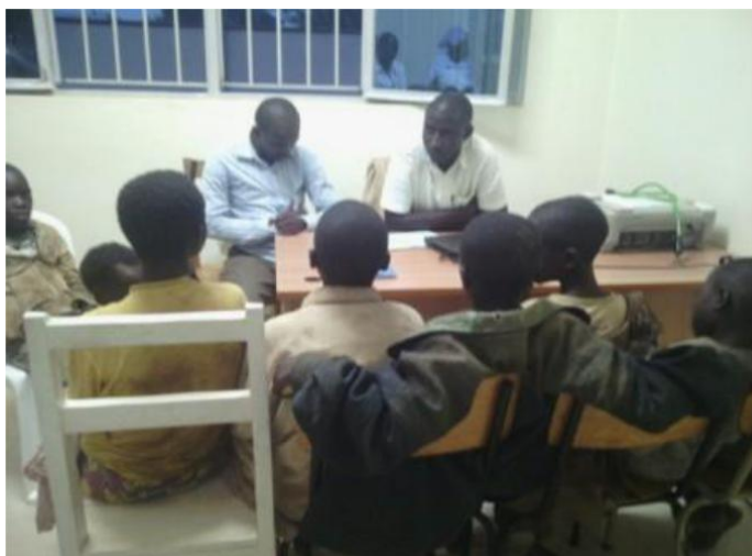
Volunteer of hope for Good Life during counseling to street children with the aim of knowing the cause of joining the street life together with sensitizing the street children to return back in their families.