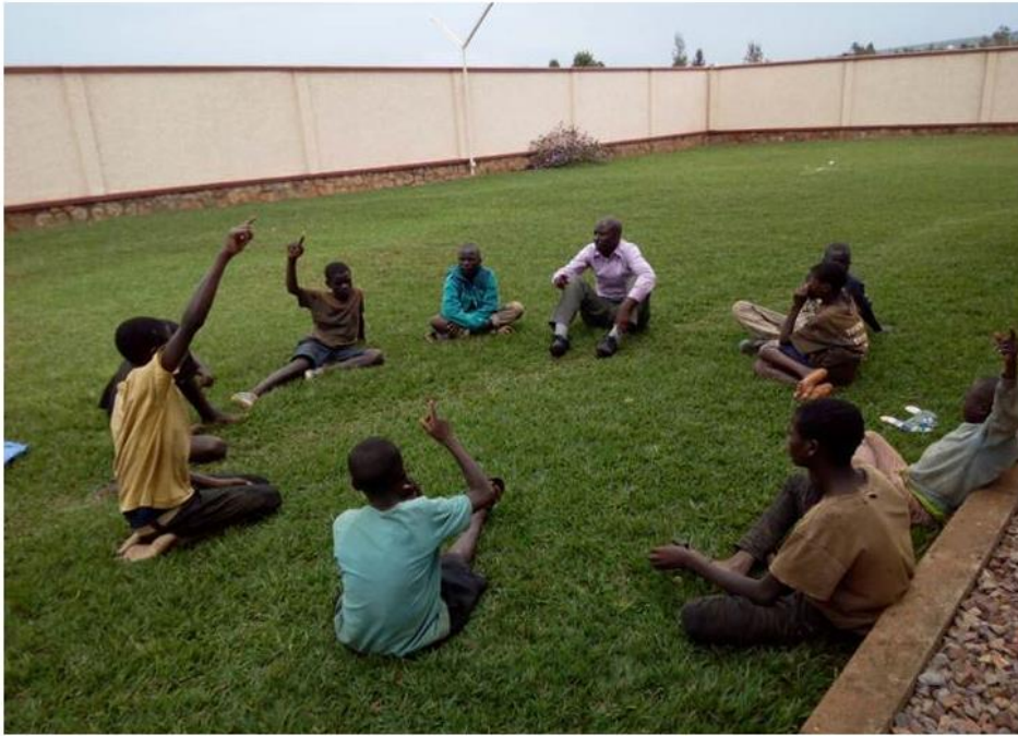
Volunteer of hope for Good Life during counseling to street children.